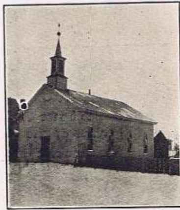
OLD M. E. CHURCH.