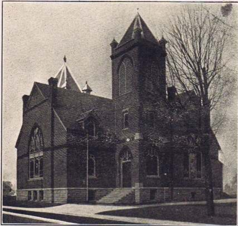
FORTVILLE METHODIST EPISCOPAL CHURCH.